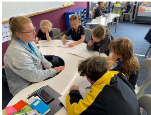
Small group focused writing workshops