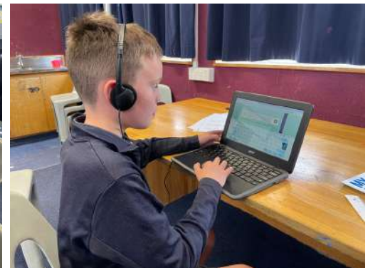
Independent Steps Web follow up work