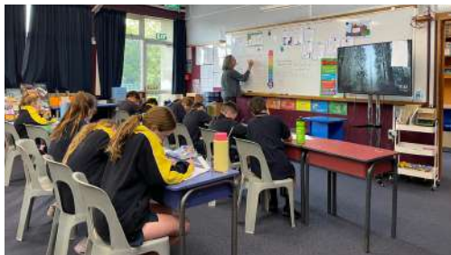
Formal handwriting instruction