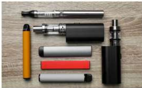
Some examples of what other vapes might look like

Please find information below about how to find the link to our policy and related procedures related to this topic.